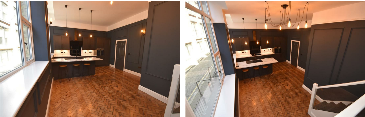
Ground Floor Apartment